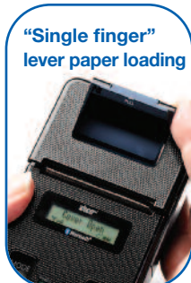
"Single finger" lever paper loading