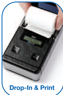
Drop-In & Print